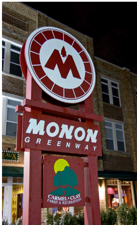
The Carmel Arts and Design District in downtown Carmel

With the help of Transportation Enhancements funds, Carmel and Hamilton County were able to develop the historic Monon Railroad into the Monon Greenway . The railroad was a critical connection between Indianapolis and Chicago. With its conversion into a rail-trail, it now provides a valuable link for pedestrians and bicyclists be-