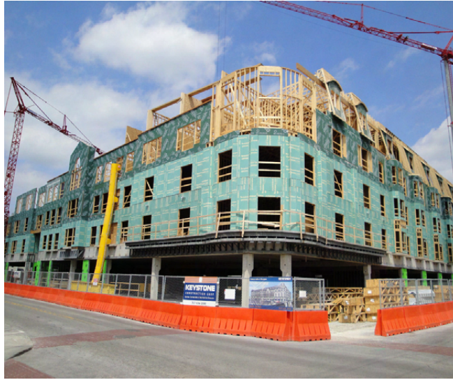
2010: Housing construction near the Monon Greenway